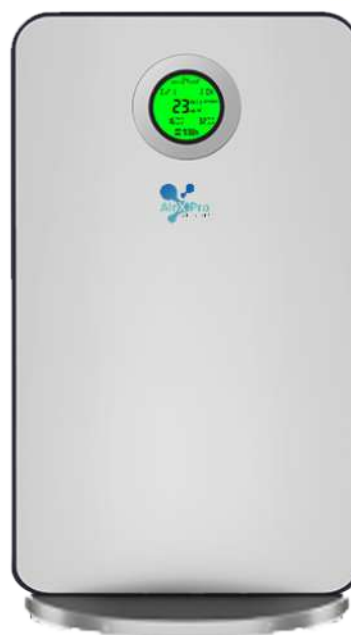
Floor Stand Included